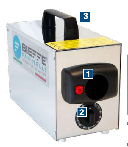
OZONE OUTPUT WITH BLOWING HOSE CONNECTION

Ozone generator for sanitizing small/medium environments