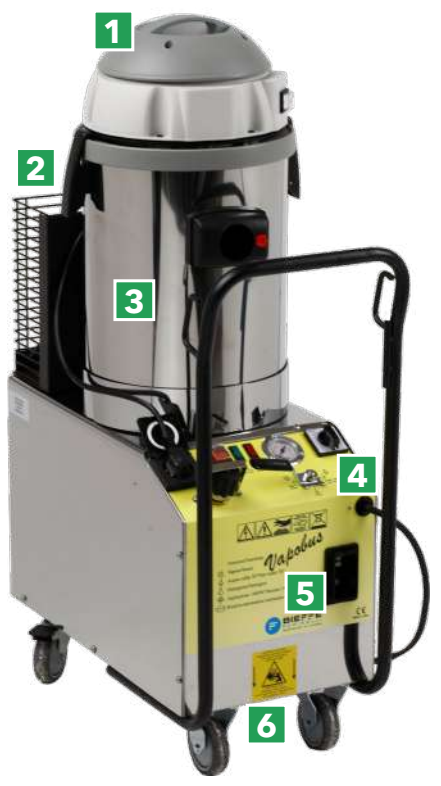
* Available with two steam guns (BF090JB04)

Steam generator specifically designed for cleaning bus interior and aisle and railroad-car. It is also used for home carwashing service, cinema, theater, chairs, sofas, armchairs and mattresses cleaning.