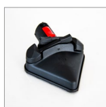
MGK06NV Triangular steam brush w/velcro