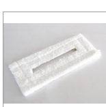
RIP6101 Rectangular steam brush w/velcro