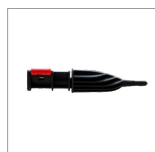
MGK04N Steam lance