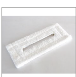
RIP6101 Rectangular steam brush w/velcro