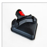
MGK06NV Triangular steam brush w/velcro