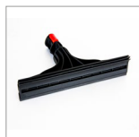
MGK05N Steam squeegee