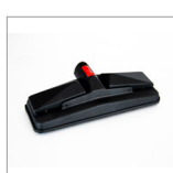
MGK07NV Rectangular steam brush w/velcro