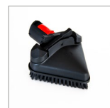
MGK06N Triangular steam brush

Magic Vapor Sani is a steam cleaning machine equipped with a device able to sanitize surfaces by using dry steam and nebulizing steam together with the sanitizing liquid (ref. RIP1519), alcohol 70%, hydrogen peroxide 1% . (test carried out by laboratories).