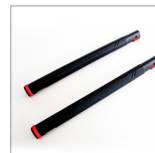
MGK02N (X2) Steam extension 2 pcs