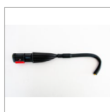
MGK04AN Curved steam lance w/ brass nozzle 12cm