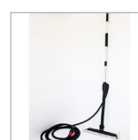
RIP0801 Professional steam mop