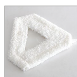
RIP6102 Microfiber triangular w/velcro white