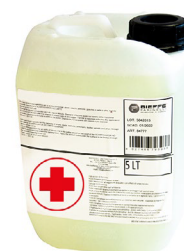
RIP1519 VOC-free sanitizing liquid for nebulizer 5 LT

**Its scent is allergenic fragrance free, following the attachment III Reg.1223/2009