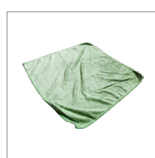
RIP6001 Microfibre cloth 300gsm 400x400mm