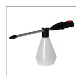
CVK36N Steam nebulizer