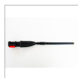
MGK04BN Steam lance w/brass nozzle 19cm