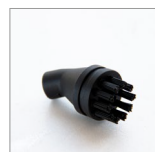
MGLND Bent small brush ø26 mm nylon