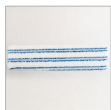
RIP0811/12/13/14 Microfiber cloth 400x100 blue strips f/ hard floor for RIP0801