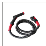
MGK01NW Flexible hose w/gun 2mt