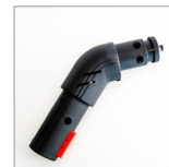
MGK03N Steam brush connector