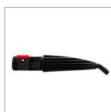
MGK04NC Bent steam lance