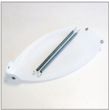
SIMPLE TEFLON SHOE 1,5 kg AR8 1,7 kg AR8G