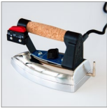
FER1200 Bieffe iron "heavy" 1,7 kg