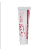
AR29 Iron cleanser paste