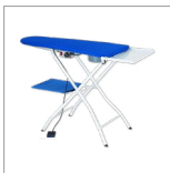
IRONING BOARDS Vacuum, heated, blowing