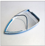
ARMOURED TEFLON SHOE 1,5 kg AR8P 1,7 kg AR8C