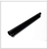
CVON (X3) Hose extensions 44 cm