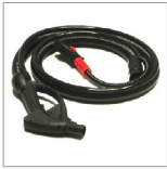
CVP5 Handle 5 mt