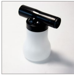
CVK53 Nebulizer for alcoholic products