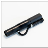
CVK535 nebulizer for handle