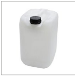
COD0407 Tank 20 lt