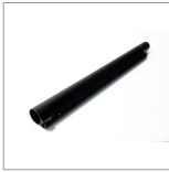
CVON Hose extension 44 cm