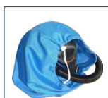
RIP1301Z Bag for ozonation of helmets/bags/shoes/ accessories dim 65x65 cm