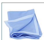
RIP1312 Bag for ozonation of mattresses/ armchairs/couches