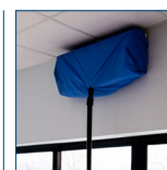
CVK32D Bag for ozonation of air conditioners