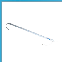
RIP6002 14W led lamp for car interiors