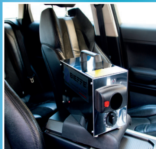
BF360 Ozone generator for sanitization