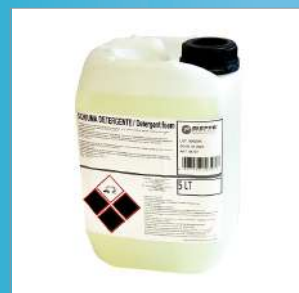
RIP1484 Detergent foam