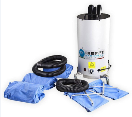
CARFON ref. BF350 DRYER FOR SEATS, MATTRESSES, CARPETS