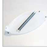
SIMPLE TEFLON SHOE