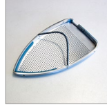
ARMoured TEFLON SHOE