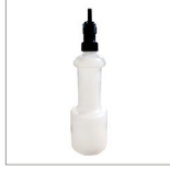
K2 Anti-drop bottle