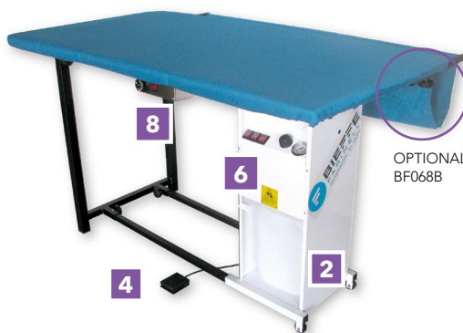
Models BF210, BF212, BF214 with board 151x81 cm