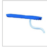
BF075 Suctioning bracket