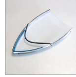
BORDERED TEFLON SHOE