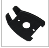
AR14 Black steamshade for Bieffe iron