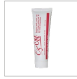
AR29 Iron cleanser paste