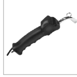
KITAV09 Steam gun kit