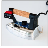
KITF002 Bieffe iron 1,7 kg w/ilme plug